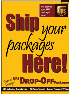
2 foot Vertical 2 sided 24"W x 36"H $35.00 each Item number - PS2ASP