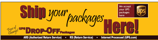
3 foot Cabinet Decal 36"W x 9"H | $12.00 each Item number - CABPEC3