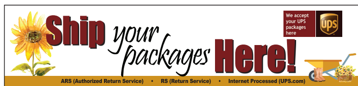
6 ft Banner 6'W x 17'H | $60.00 each Item number - SPBANNER