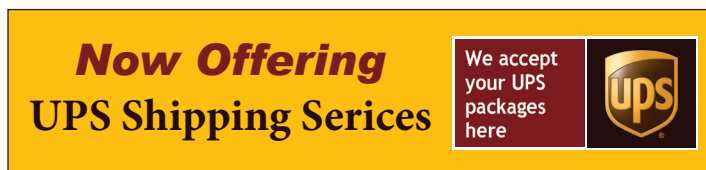
6 ft Banner 6'W x 17'H | $60.00 each Item number - NOBANNER