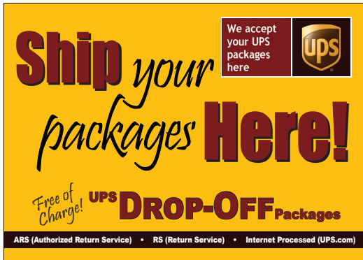
4 foot Horizontal 2 sided 48"W x 33"H | $70.00 each Item number - PS4ASP

Sign placement is critical, which is why we provide numerous sizes that can be used in different locations. You can order more signs in addition to the ones provided in your starter kit by either calling us at 800-274-4732, or e-mailing us at info@packageexpresscenters.com . Please note that all signs are shipped F.O.B. Greeneville, TN.