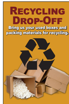
2 foot Vertical 2 sided | 24"W x 36"H $29.99 each Item number - RSIGN

Placement of this banner in your shipping area will not only direct customers to the right place but will give them some tips on how to ship properly.