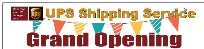
6 ft Banner 6'W x 17'H | $60.00 each Item number - GOBANNER