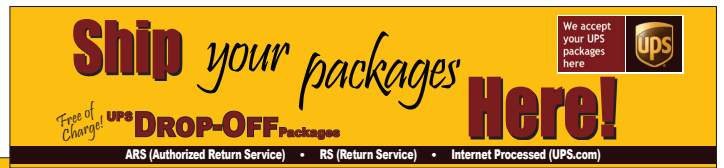
6 ft Banner 6'W x 17'H | $60.00 each Item number - BANNER6