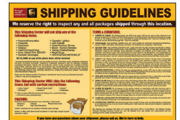
Shipping Guidelines 26"W x 20"H | $30.00 ea. Item number: GUIDE