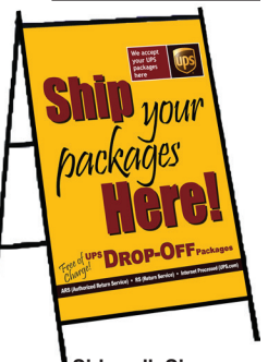
Sidewalk Sign Includes metal frame and 2 vertical signs - 24"W x 36"H $99.95 each Item number: SIDESIGN