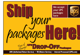
Monitor Sign 23"W x 15"H | $32.00 each Item number - MONSIGN