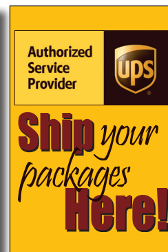
2 foot Vertical 2 sided | 24"W x 36"H $29.99 each Item number - 2FTSIGN